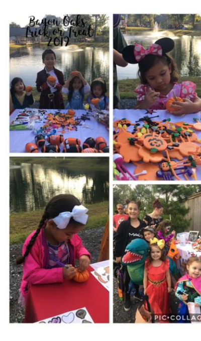
Thank you to everyone that came out to our annual Bayou Oaks Trick or Treat event!